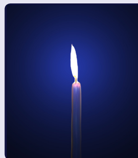
World Suicide Prevention Day

The International Association for Suicide Prevention invites you to light a candle at 8 PM